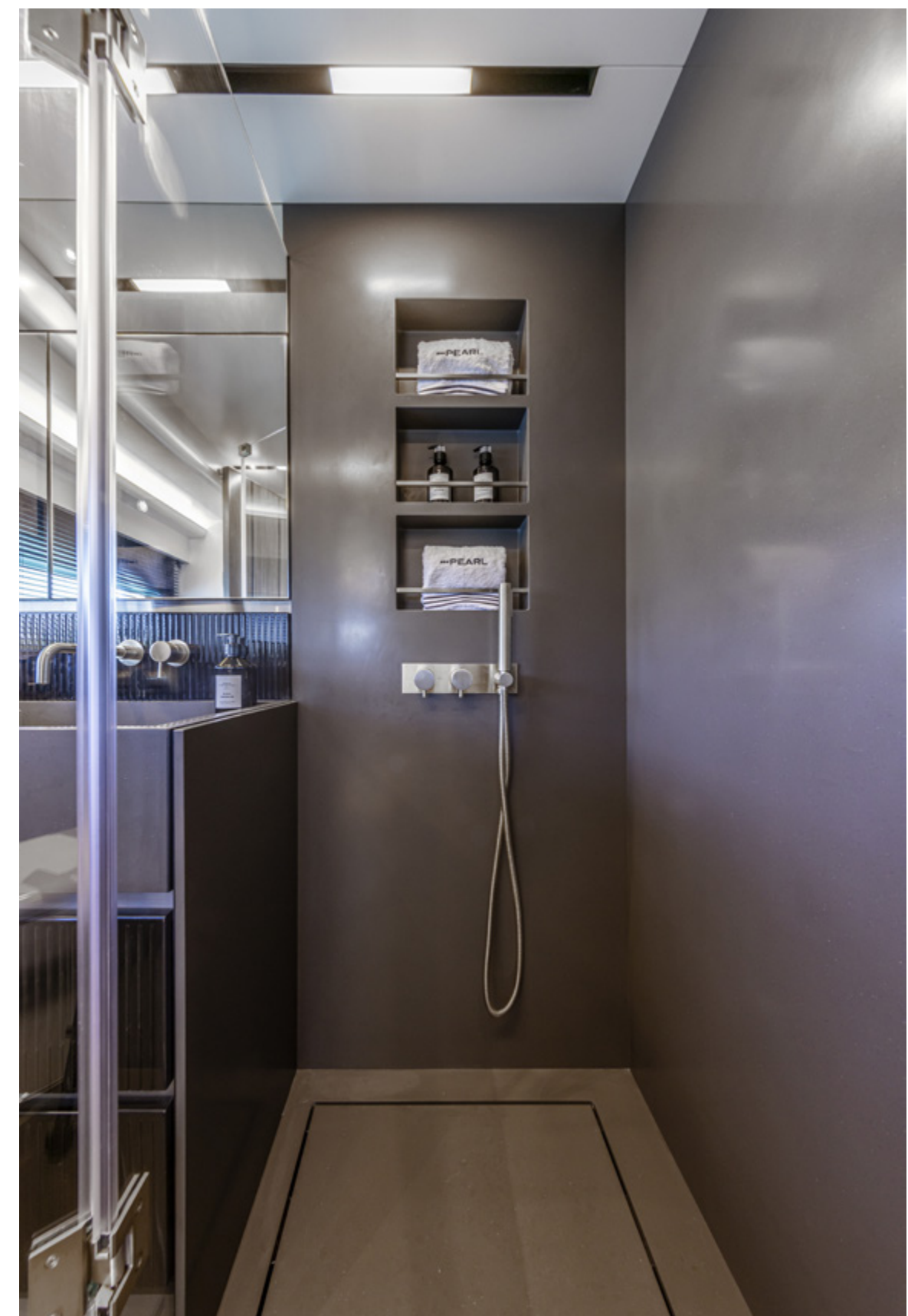
FORWARD MASTER CABIN