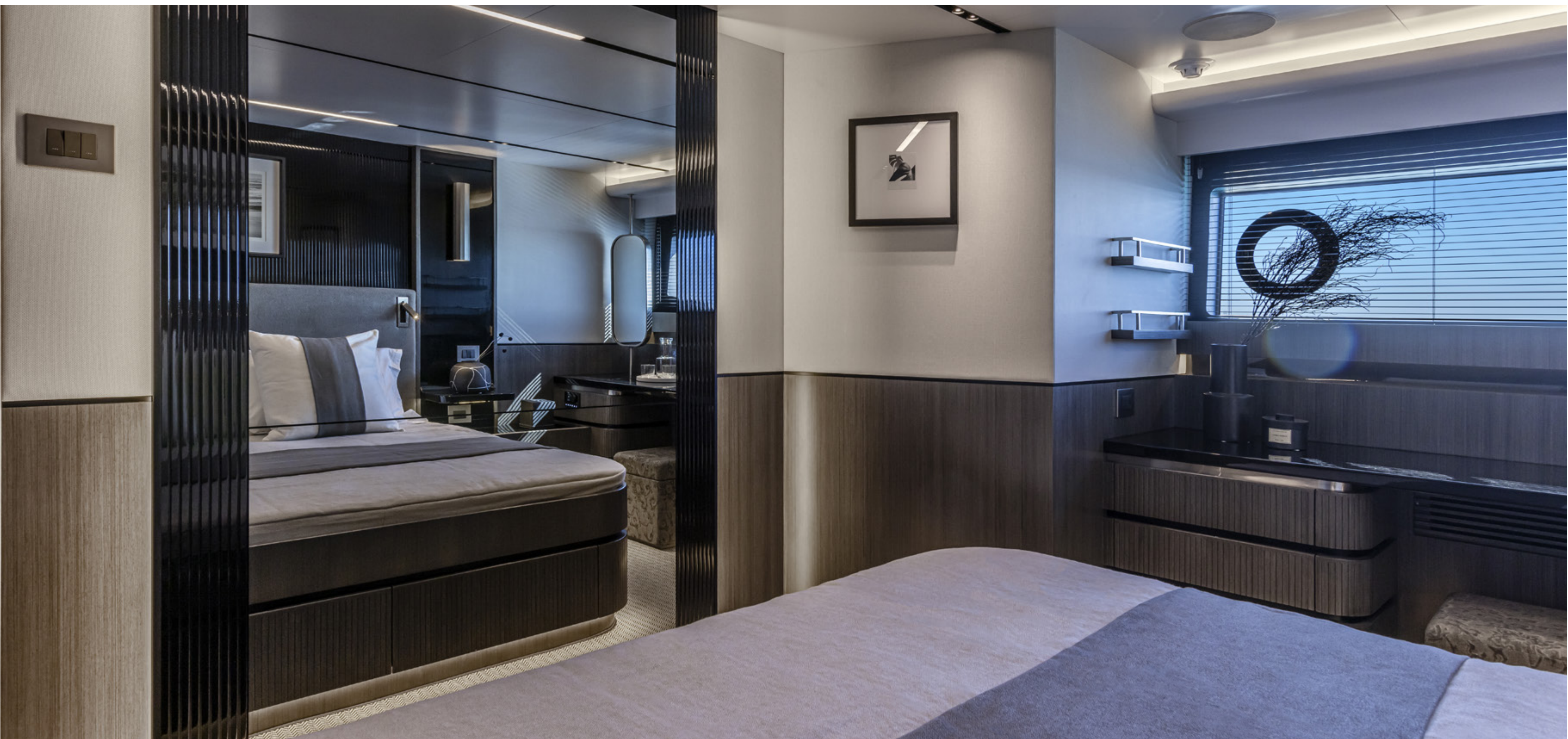
MASTER CABIN 2