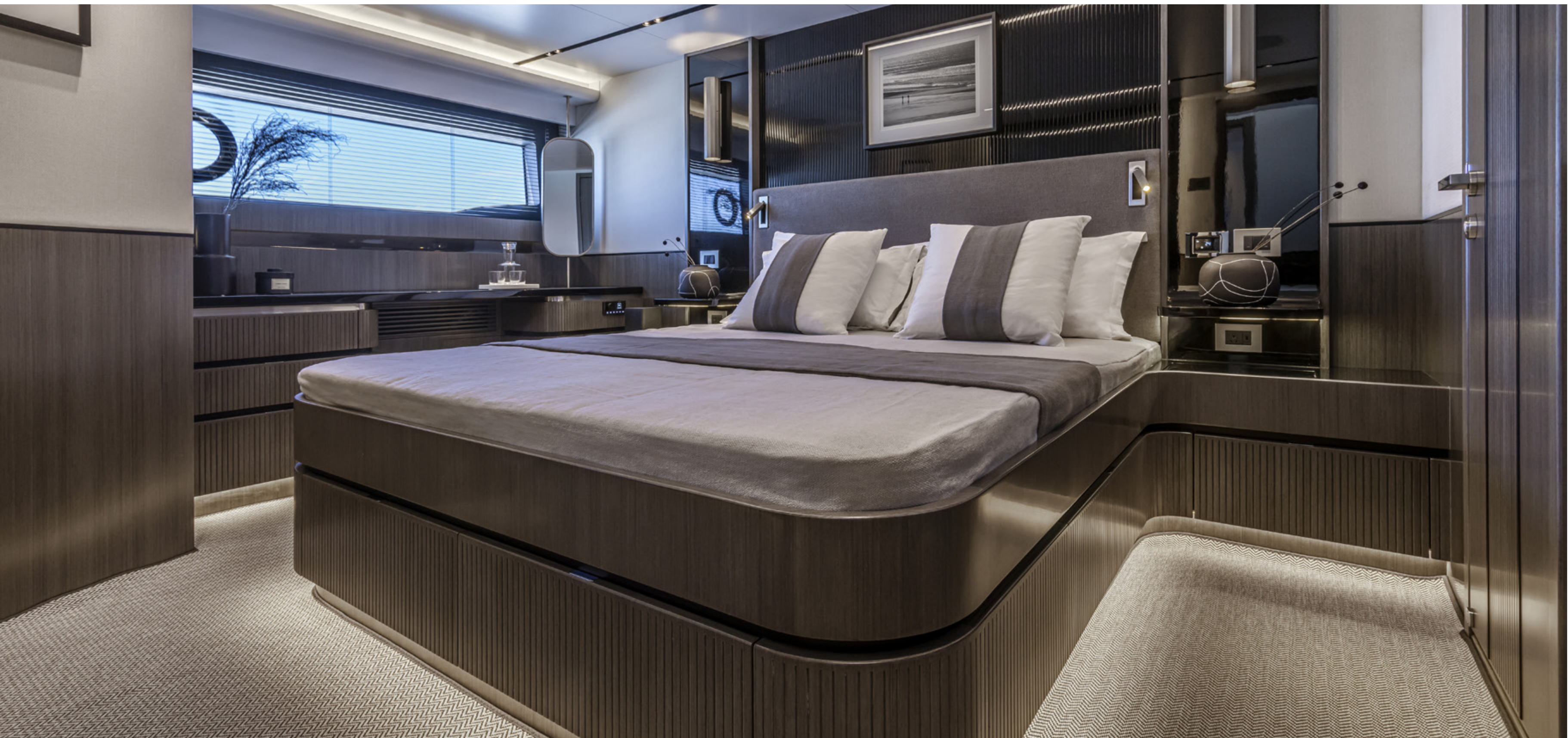
MASTER CABIN 2