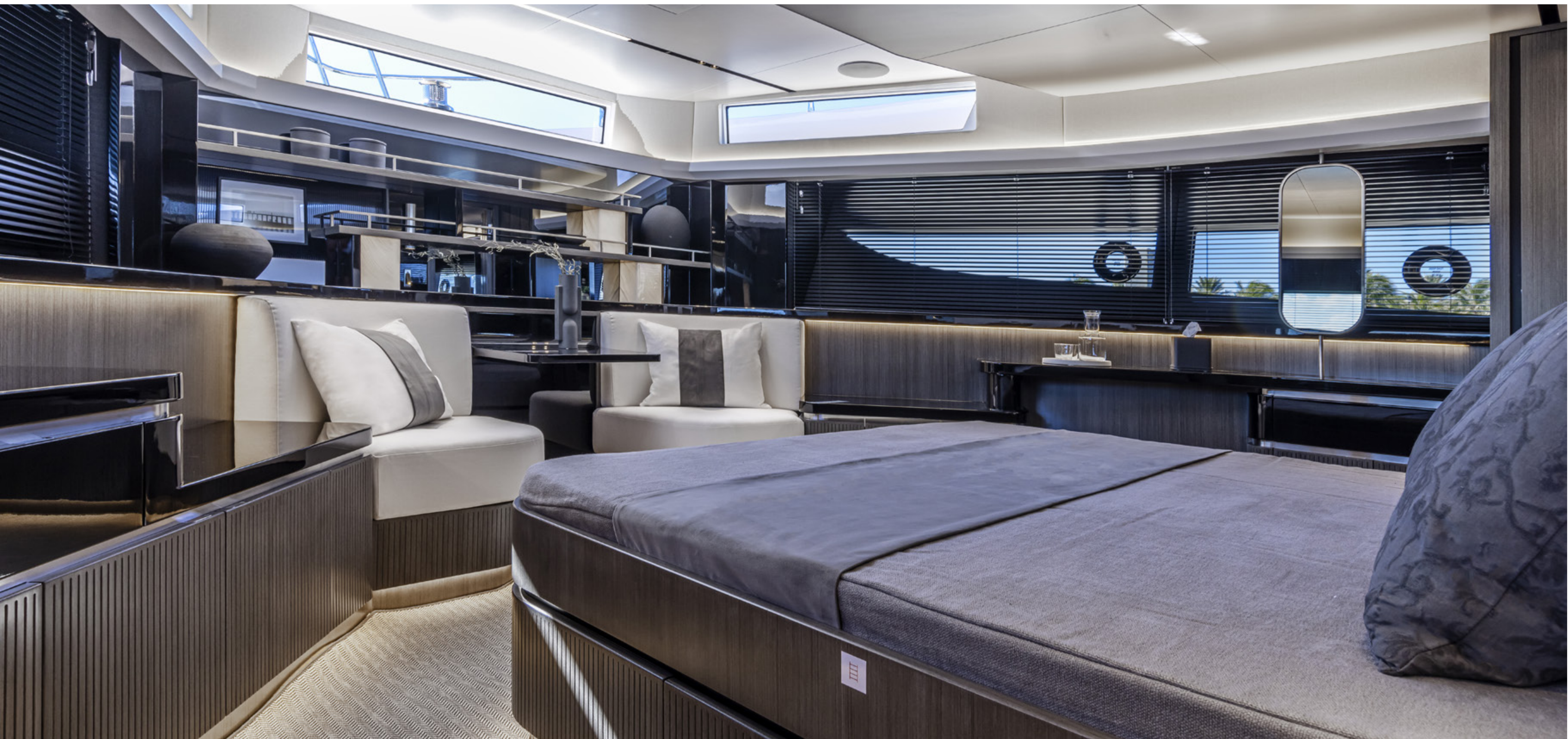
FORWARD MASTER CABIN