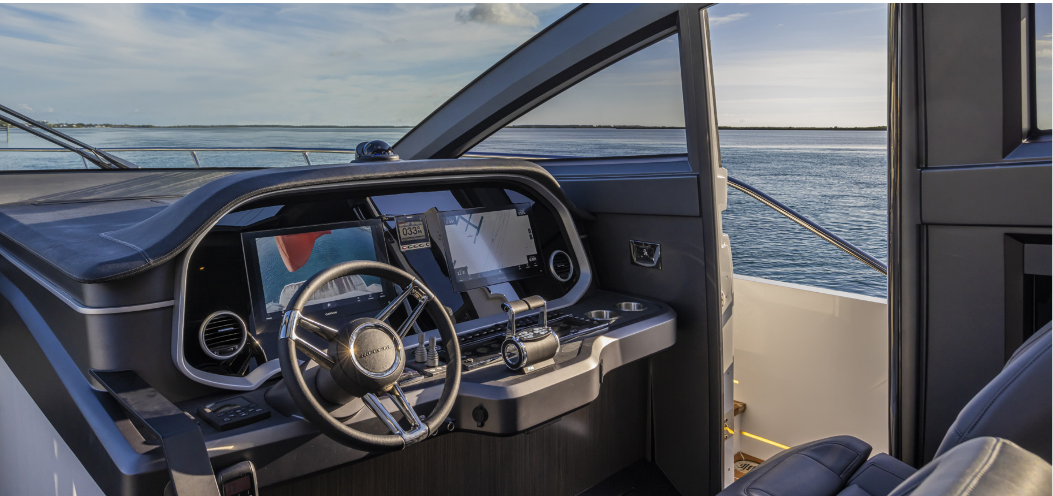
HELM STATION WITH SIDE DOOR