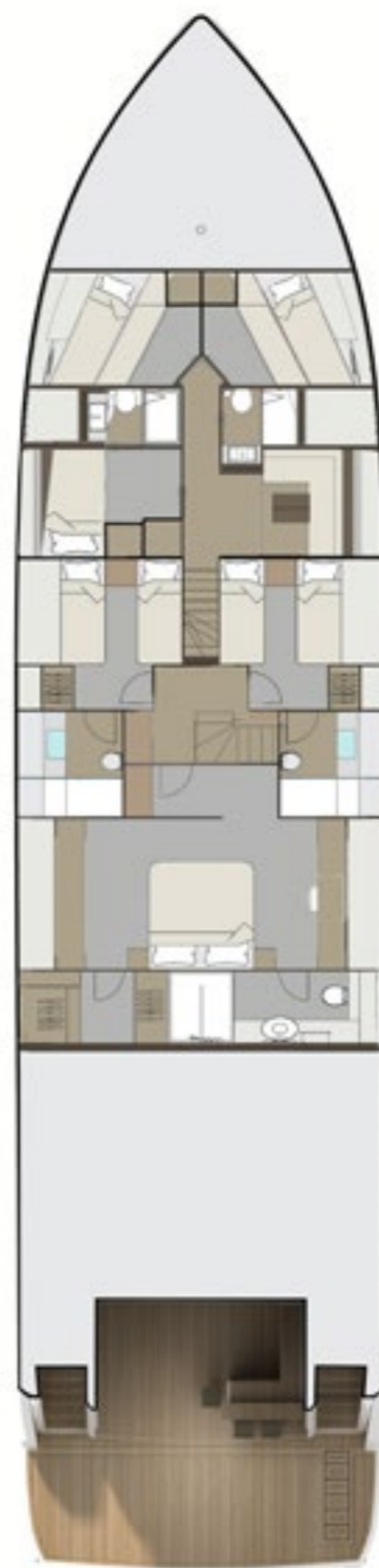
4 CABIN LAYOUT